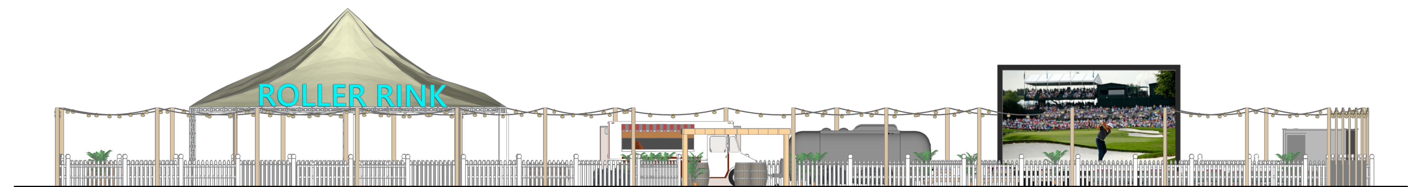
1 North Elevation Scale 1:100